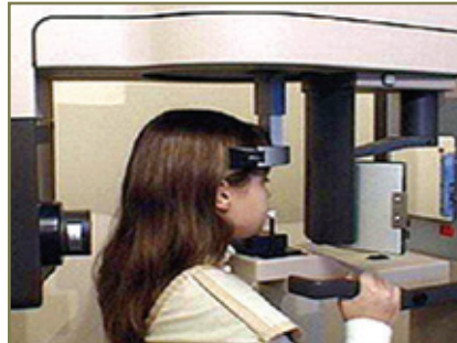
The camera rotates around you